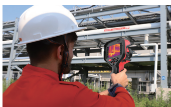
Handheld Temperature Measurement Devices