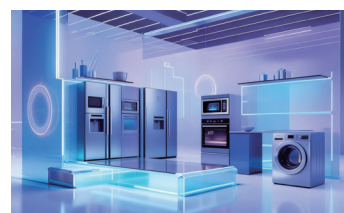
Smart Home Appliances