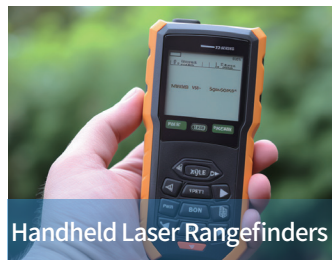
Handheld Laser Rangefinders