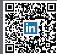
LinkedIn Official Account